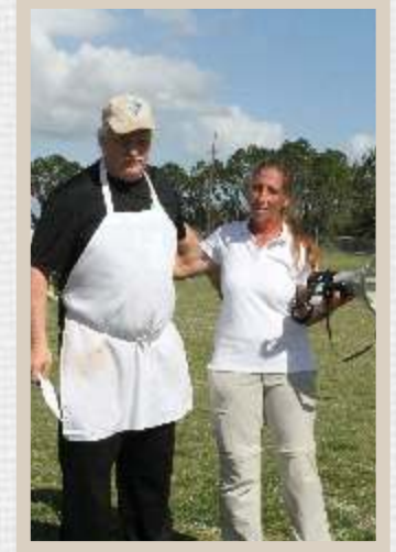
An unexpected protection entry!