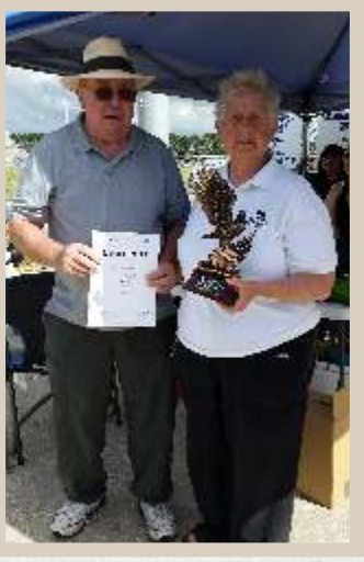
At the draw