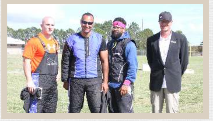
IPO 2 Podium